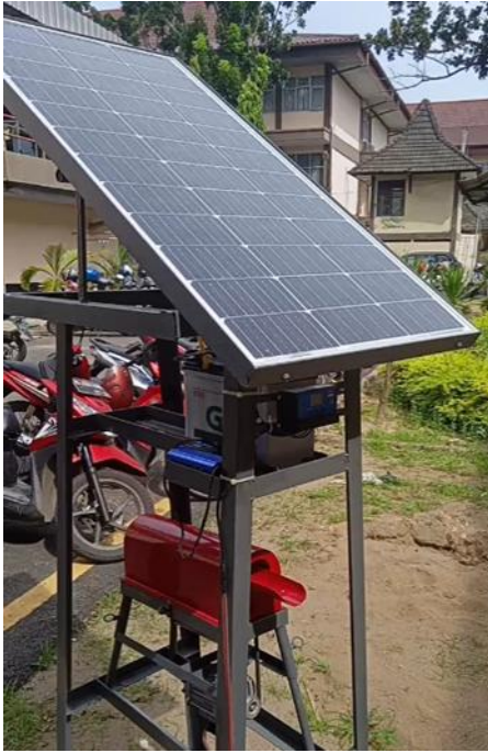
Fig. 3. Prototype of the solar-powered maize sheller.

The electrical side, a 200 Wp mono-crystalline solar panel was connected to a 10A solar charge controller, which regulates the charging of a 12 V–20 Ah sealed lead-acid battery. High-torque AC motor 200 W was integrated as the main driving unit, supported by an inverter 300 W output for DC–AC conversion when required. After all mechanical and electrical subsystems were installed; an initial functional test was conducted to check alignment, power transmission, and electrical connectivity. Any technical issues identified during this stage were resolved through troubleshooting and fine-tuning adjustments. Only after ensuring proper integration of all components did the prototype proceed to the full-scale performance testing phase.