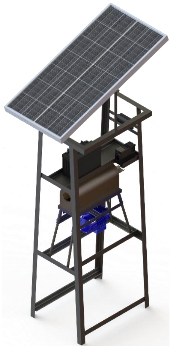
Fig. 2. Design of the solar maize sheller.

Based on the calculated power requirements, a 12 V AC electric motor with a rated power of 200 W was selected because of its ability to deliver stable output power, high durability, and reliable performance under varying load conditions, which made it suitable for solar-based operation. Furthermore, the capacity of the 200 Wp solar panel and the 12 V–20 Ah battery was determined through calculations of total energy demand during operating cycles, effective working time, and estimated recharge time using solar irradiance data from the test location. The selection of structural components, such as angle steel frames (steel L 40×40 mm), carbon steel shafts, protective plates, pillow block bearings, and the pulley–V belt transmission system, was based on material strength analysis, safety factors, local material availability, and ease of manufacturing. All technical specification decisions were not only based on theoretical considerations, but were also validated through literature studies, machine design standards, and empirical experience from similar machines, so that Table 1 represents the final outcome of a rational, measurable, and application-oriented specification selection process for a solar-powered maize shelling machine that is efficient, economical, and suitable for rural environments.