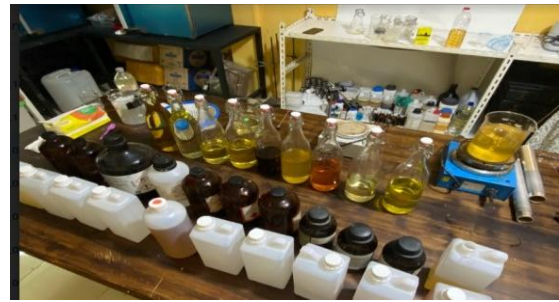
Picture 5. Distillation process of Mi Amore Essential Oil and Perfume Products

Follow-up is feedback from the results of PKM program evaluation, directing program sustainability or program improvements that can be done in the future. Based on the results of evaluation and reflection, it is necessary to follow up as follows: