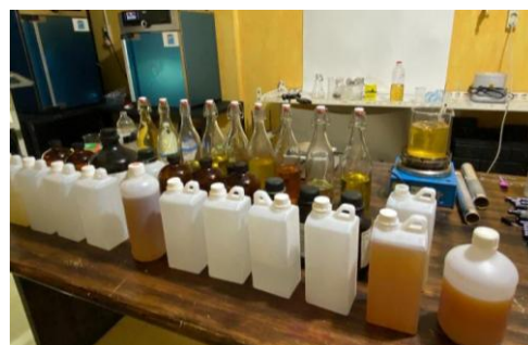
Picture 1. (a) Distillation Equipment (b) Distilled Essential Oil Products

Vacuum distillation is a distillation whose operating pressure is below atmospheric pressure. This principle is based on the laws of physics where a liquid will boil below its normal boiling point if the pressure on the surface of the liquid is reduced or vacuum. The function of vacuum distillation is to lower the boiling point so as not to damage the components of the separated substance. This principle of pressure drop is very suitable for refining essential oils to avoid cracking or damage to essential oils [6].