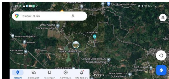
Picture 2. Map of Community Service Activities in Jeulekat Village, Blang Mangat District

national leading products to help farmers and the community in increasing the productivity of essential oil-producing plants that have a large economic prospect in Jeulekat village, Blang Mangat district.