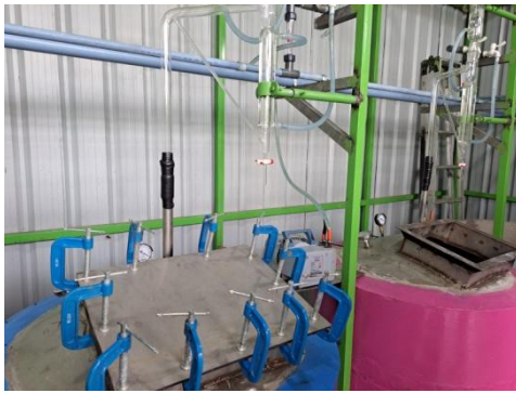
Picture 2. Vacuum System Distillation Equipment