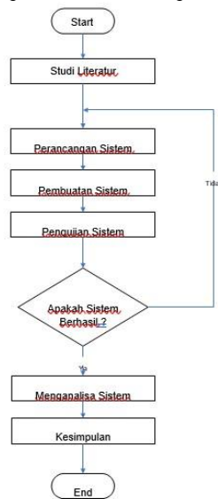
Figure 1. Flowchart

This research was carried out with several stages as shown in Figure 1.